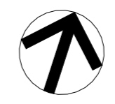
1 SITE PLAN A000 3/32" = 1'-0"