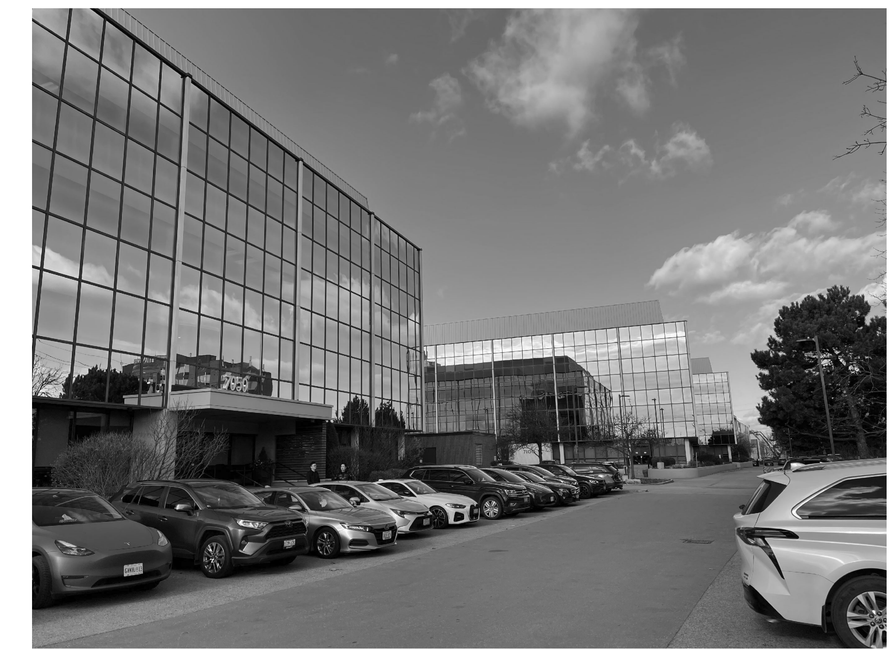
EXISTING OFFICE BUILDING 7050 WOODBINE AVE